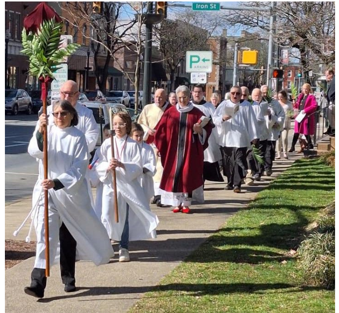
Palm Sunday

We may never see him in our worship space, but we offered him something that was deeply moving.